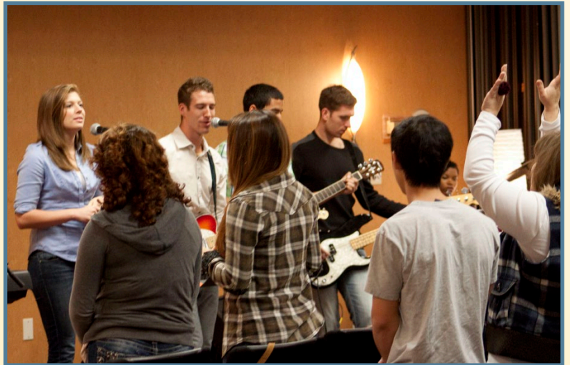
Bluemont Church worships at Holiday Inn Manhattan at the campus.