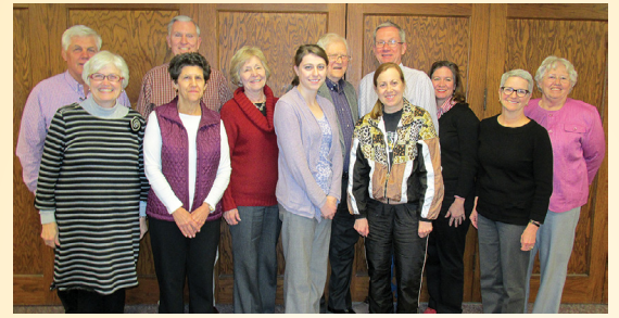
2014 Board of Directors